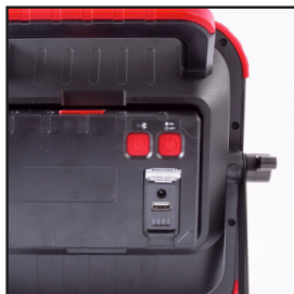
USB Accessory Charger