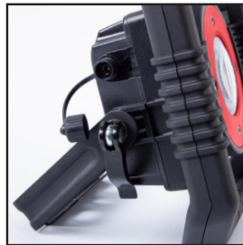
Water Resistant Charger Cover