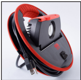
Directional LED Swivel

4 industrial grade magnets on the back allow for easy mounting when space is limited or the adjustable kickstand can be used on a table or floor