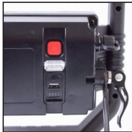
USB Accessory Charger