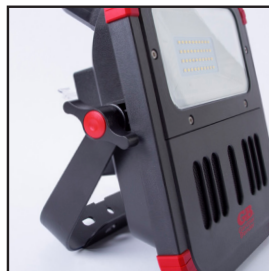
Quick release locking and rotating base