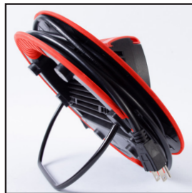
Built in Stand & Power Cord Caddy