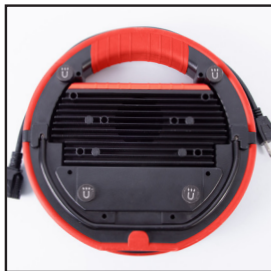
4 Heavy Duty Magnets