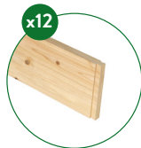
4ft. x 5.5 in. Boards