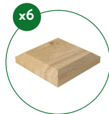
3.5in. x 3.5in. Decorative Caps