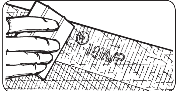
Fig 2 Rub squeegee/plastic sealing tool firmly across the tape surface removing air bubbles and folds until the the facing reinforcement shows clearly through the tape. Avoid puncturing or tearing the tape.

Using any suitable heating iron with the plate temperature set at approximately 400 °F (200 °C), pre-heat the area to be taped. Quickly position the tape on the pre-heated area and press in place. Pass the iron two or three times over the taped area using a rapid ironing motion (see Fig. 3).