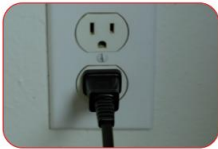
110V Wall Plug Use