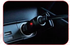
12V & 24V 2 in 1 Vehicle Plug Use