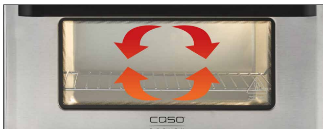
With practical preheat function