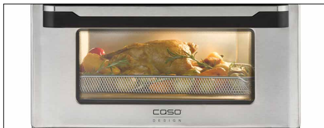
Modern Design Air Fryer Oven with a capacity of 26 quarts