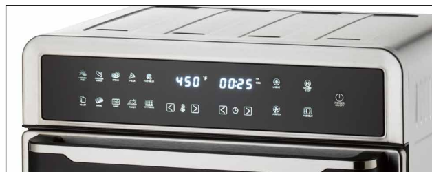
Operation with LED touch display / control panel