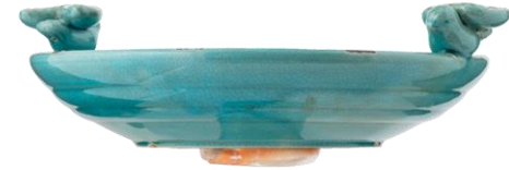
Birdbath Top 1x