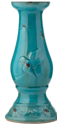
Birdbath Base 1x