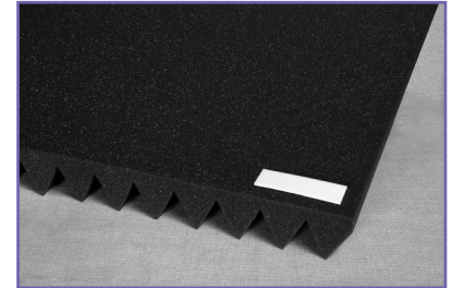
EZ-Stick Pro™ Tabs shown

Clean attachment points on the wall surface with Isopropyl alcohol ( avoid household cleaners ), wipe gently and let dry. Separate the EZ-Stick Pro Tabs from each other. Remove one of the paper release liners from the strip. Apply the tabs on the rear of the panel near the outside edges with heavy, uniform pressure ( heel of hand ). Orient vertically for maximum holding strength. Remove the second paper release liner from the backside of the tab, position the panel with the target location on the wall and press firmly to attach. Use 2 Pro Tabs for a 1' x 1' Studiofoam panel, 4 Pro Tabs for a 2' x 2' Studiofoam panel and 6 Pro Tabs for a 2' x 4' Studiofoam panel.