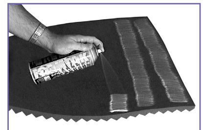
Application of Auralex® FoamTak™ shown