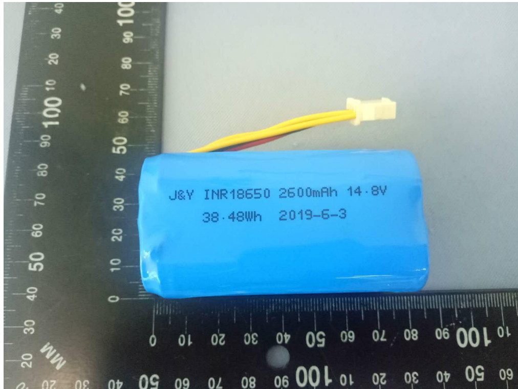
Fig.1 Overall view I of battery