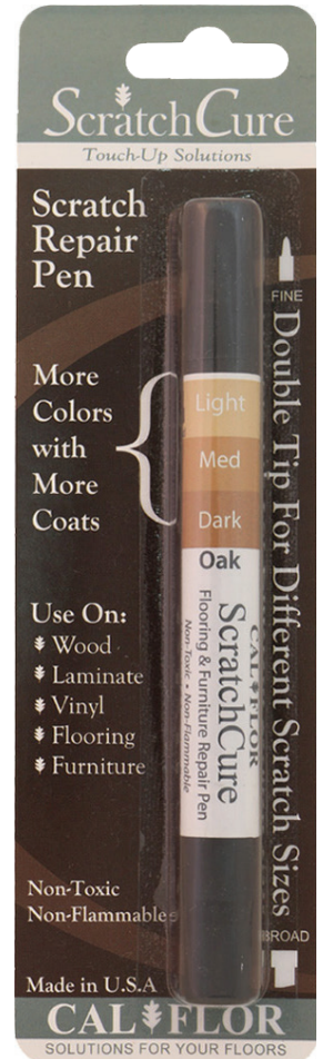
Retail Blister Card