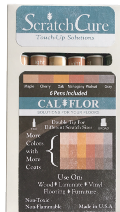
Rainbow Pack PE49400RP