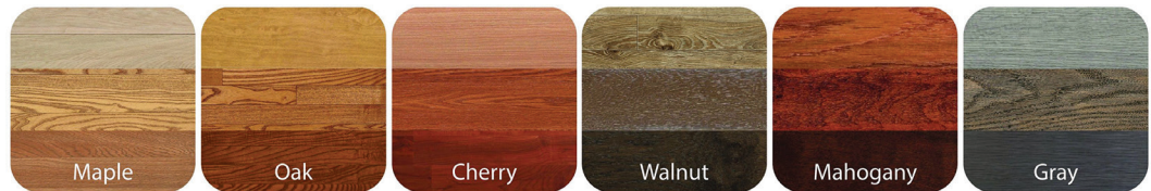
Maple PE49402CF Oak PE49403CF Cherry PE49404CF Walnut PE49406CF Mahogany PE49405CF Gray PE49401CF

FOR USE ON Floors, Fixtures & Counter tops Wood, Laminate Tile, Stone, Vinyl