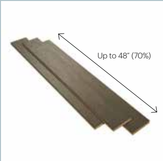
Engineered Click Lock