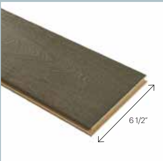
Engineered Tongue & Groove