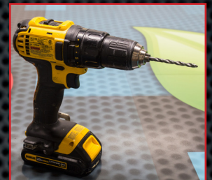
Power Drill and Phillips Bit