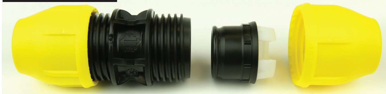
Figure 1: Fitting Nut Reassembly