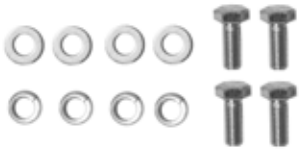
Set of 4 Lock Washers, 4 Washers and 4 Bolts

Identify and locate all parts listed below