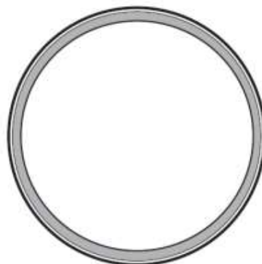
DRAWING OF IMAGE