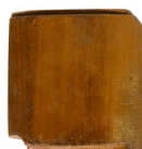
Fountain Back Door 1x