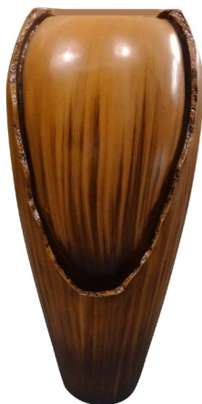
Fountain (LED lights pre-installed) 1x