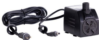
Fountain Pump 1x