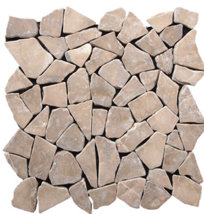
Blend / Code: xr3rtn