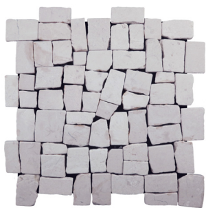
White / Code: xq3rwh