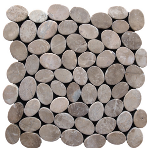
Tan / Code: xc3rtm