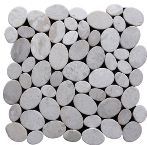
White / Code: xc3rwh