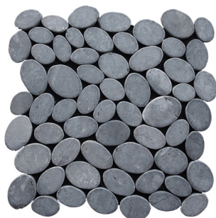
Grey / Code: xc3rgy