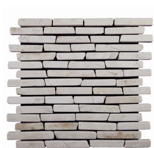
White / Code: xl3rwh