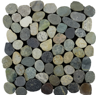
Blend / Code: xs3pgo