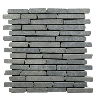
Grey / Code: xl3rgy