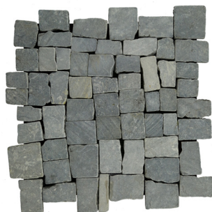
Grey / Code: xq3rgy