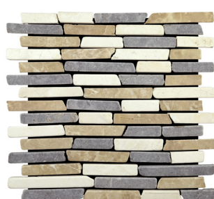
Blend / Code: xl3rtwg