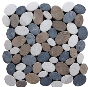
Blend / Code: xc3rtwg