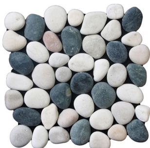
Blend / Code: xp3pbwt