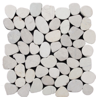
White / Code: xs3pwh