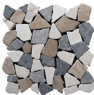
Blend / Code: xr3rtwg