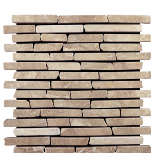
Tan / Code: xl3rtn