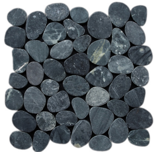
Black / Code: xs3pbk