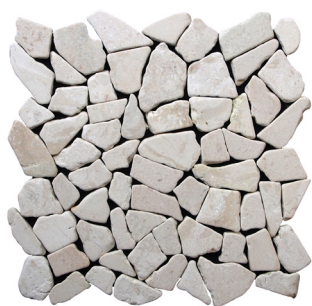
White : xr3rwh