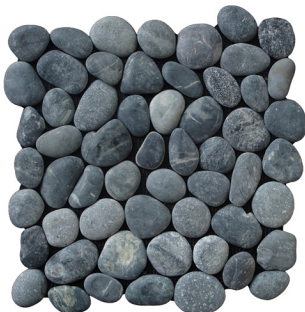
Black / Code: xp3pbk