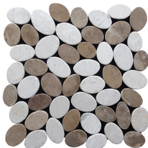
Blend / Code: xc3rtwh