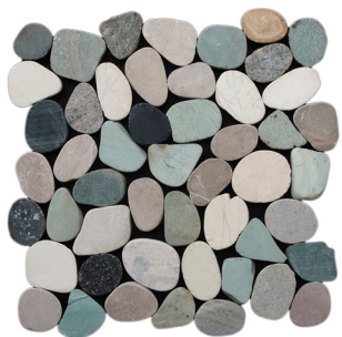
Blend / Code: xs3pbgt