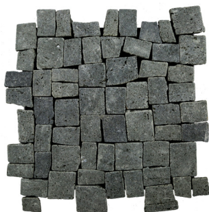
Black / Code: xq3rbk