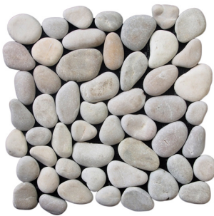
Tan / Code: xp3ptn