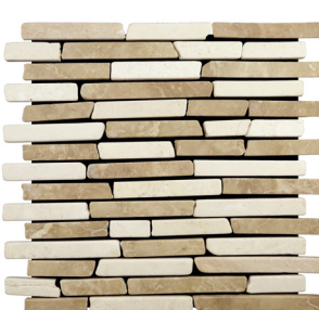
Blend / Code: xl3rtwh