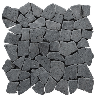
Black / Code: xr3rbk