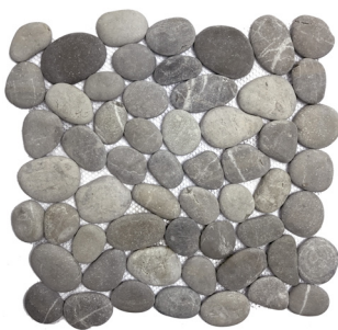
Grey / Code: xp3pgr