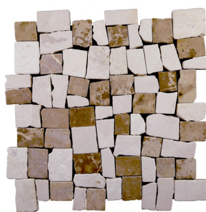
Blend / Code: xq3rtwh