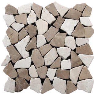
Blend / Code: xr3rtwh