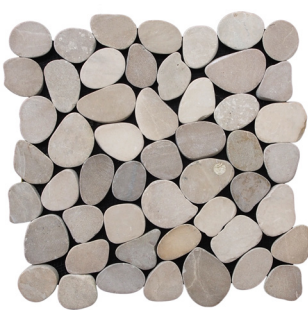
Tan / Code: xs3ptn