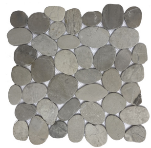
Grey / Code: xs3pgr