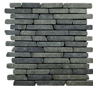
Black / Code: xl3rbk