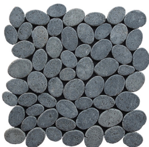
Black / Code: xc3rbk