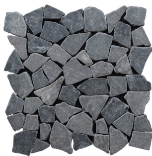
Grey / Code: xr3rgy