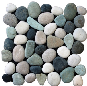
Blend / Code: xp3pbgt