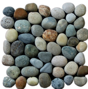
Blend / Code: xp3pggo