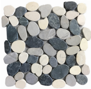
Blend / Code: xs3pabk