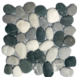
Blend/ Code: xp3pabk