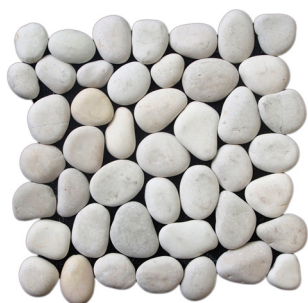
White / Code: xp3pwh