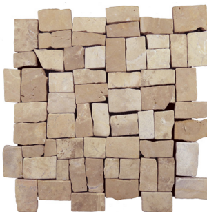
Tan / Code: xq3rtn