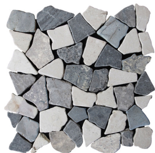
Blend/ Code: xr3rlgw