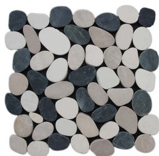
Blend / Code: xs3pbwt