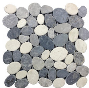
Blend/ Code: xc3rlgw