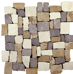
Blend / Code: xq3rtwg