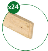
x24 4ft. Boards