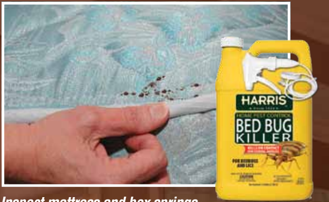
Inspect mattress and box springs for bed bug activity. Spray mattress and allow to dry.