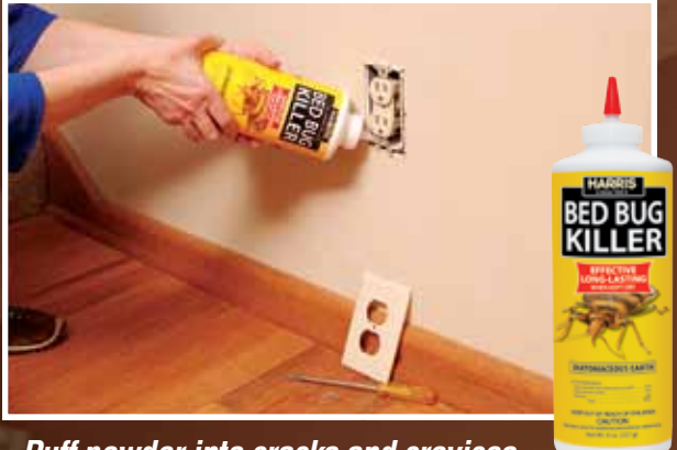
Puff powder into cracks and crevices.