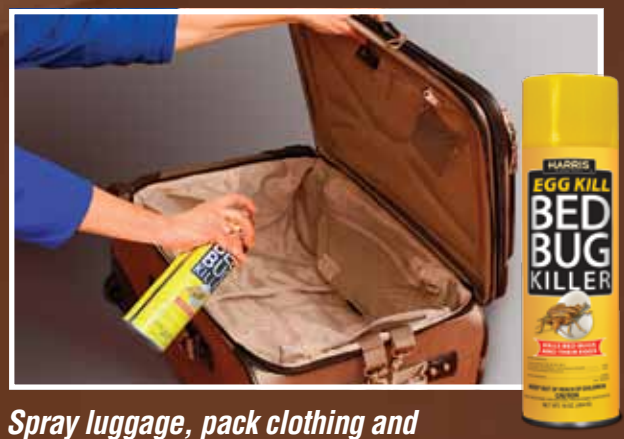
Spray luggage, pack clothing and personal effects in plastic bags.