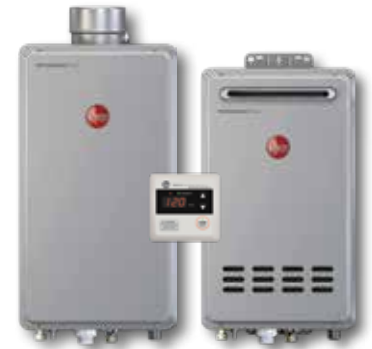
Indoor DV Outdoor PERFORMANCE PLUS Non-Condensing Tankless 11,000-199,900 BTU/h

See Warranty Certificate for complete information