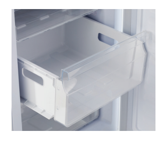
Multiple storage drawers for easy access