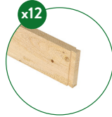
4 ft. x 3.5 in. Boards