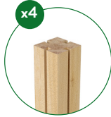
11 in. x 2.5 in. x 2.5 in. Tall Posts