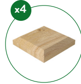
3.5 in. x 3.5 in. Decorative Caps