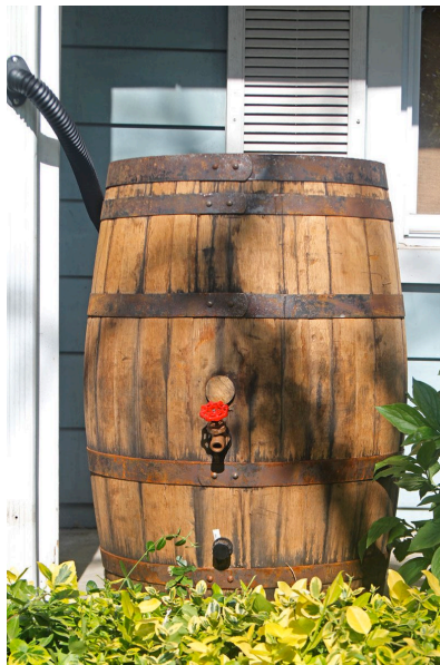
Oak Rain Barrel