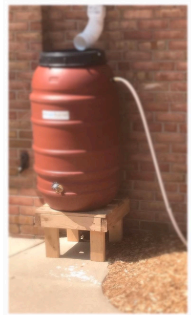
Rain Barrel Stand