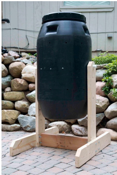
DIY Compost Tumbler

Please enjoy a 10% discount off all of your future orders from mirainbarrel.com by typing "10OFF" in at checkout