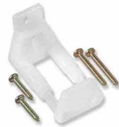
Wall mounted door guide

Optional wall mounted door guide can be used with internal slotted doors (dado) or operate outside guided