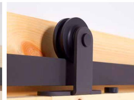
BD101K Top Mount Kit Bronze Finish