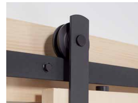
BD100K Straight Strap Kit Matte Black Finish