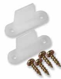
Floor mounted door guide

Optional floor mounted door guides with outside guided operation