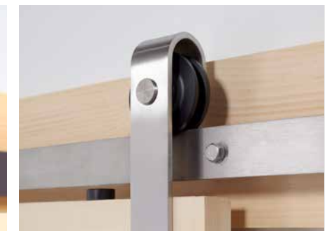
BD102K Bent Strap Kit Stainless Steel Finish