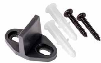
Standard metal floor mounted door guide

Standard floor mounted door guide used with internal slotted doors (dado)