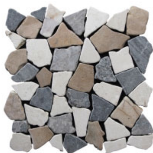
Blend / Code: xr3rtwg