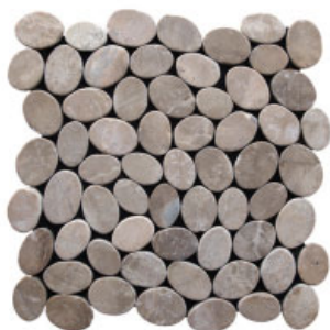
Tan / Code: xc3rtn