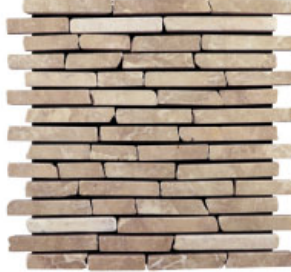
Tan / Code: xl3rtn