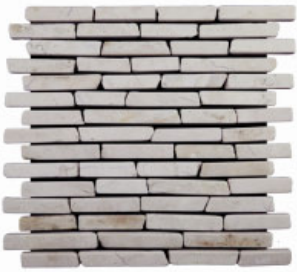
White / Code: xl3rwh