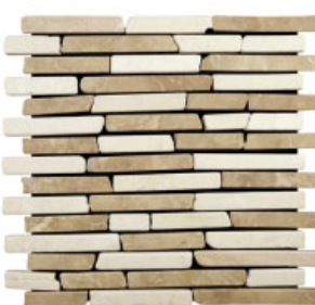
Blend / Code: xl3rtwh