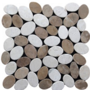
Blend / Code: xc3rtwh