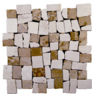
Blend / Code: xq3rtwh