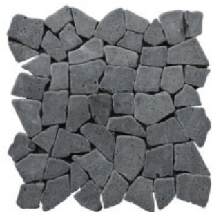
Black / Code: xr3rbk