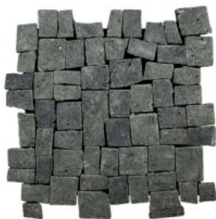
Black / Code: xq3rbk