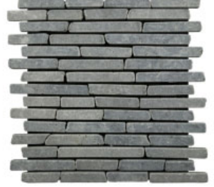
Grey / Code: xl3rgy