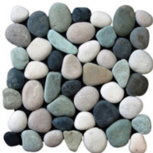
Blend / Code: xp3pbgt