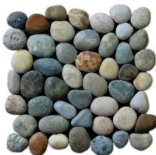
Blend / Code: xp3pgo