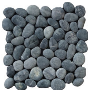
Black / Code: xp3pbk