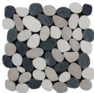
Blend / Code: xs3pwt