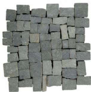
Grey / Code: xq3rgy