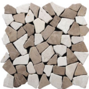
Blend / Code: xr3rtwh