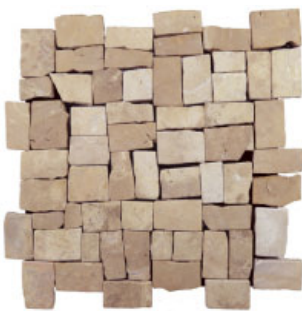
Tan / Code: xq3rtn