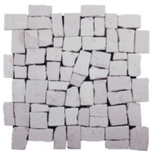
White / Code: xq3rwh