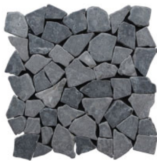
Grey / Code: xr3rgy