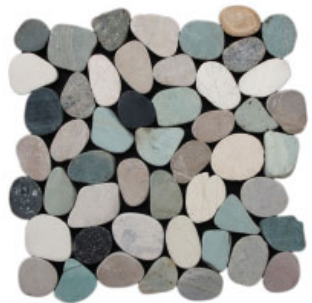
Blend / Code: xs3pbt