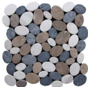
Blend / Code: xc3rtwg