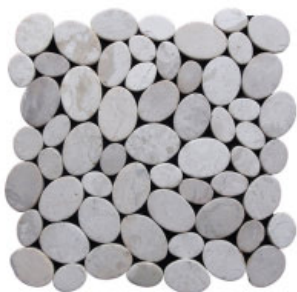
White / Code: xc3rwh