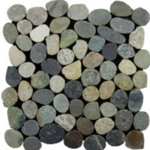
Blend / Code: xs3pgo