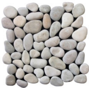
Tan / Code: xp3ptn