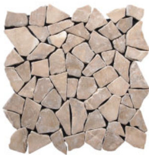
Blend / Code: xr3rtn