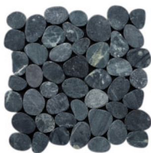
Black / Code: xs3pbk