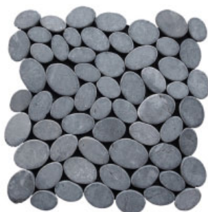
Grey / Code: xc3rgy