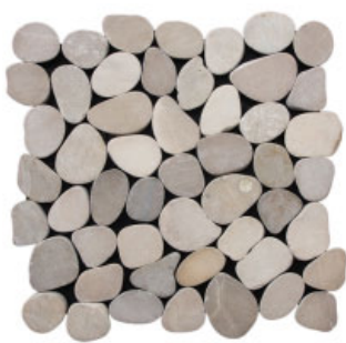
Tan / Code: xs3ptn