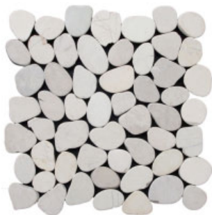
White / Code: xs3pwh