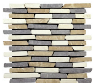
Blend / Code: xl3rtwg