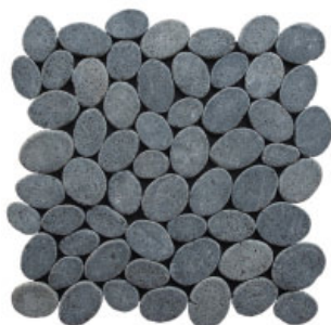
Black / Code: xc3rbk