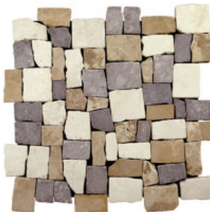
Blend / Code: xq3rtwg