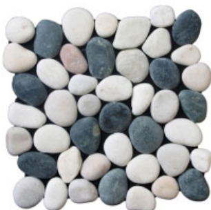
Blend / Code: xp3pbwt