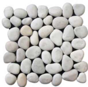
White / Code: xp3pwh