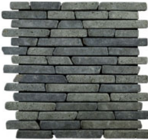
Black / Code: xl3rbk