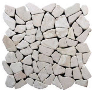
White : xr3rwh