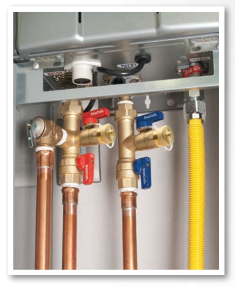
Compact design ideal for cover and recessed box installations