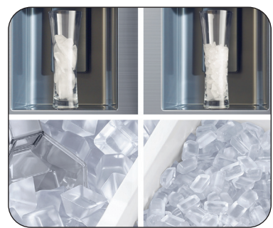
Refrigerator: Curved and Crushed Ice Freezer: Cubed and Ice Bites™