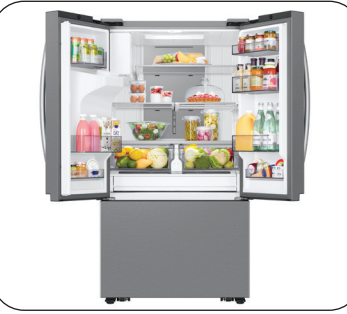
Large 31 cu. ft. Capacity