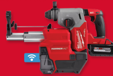
M18 FUEL 2914-22DE 1" SDS Plus Rotary Hammer w/ ONE-KEY™ & HAMMERVAC™ Dedicated Dust Extractor Kit