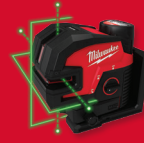
M12 3624-21 Green Laser – Cross Line & 4-Points