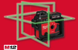
M12 3642-21 Green 360° 3-Plane Laser w/ Automatic Alignment & Receiver