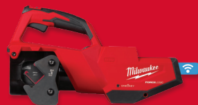
M13 FORCELOGIC™ 2933-20 Single Channel Strut Shear

M13 FORCELOGIC™ Single Channel Strut Shear Kit 2933-21