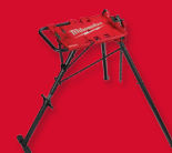
48-22-8690 6" Leveling Tripod Chain Vise