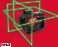
M12 3632-21 Green Laser – 360° 3-Plane