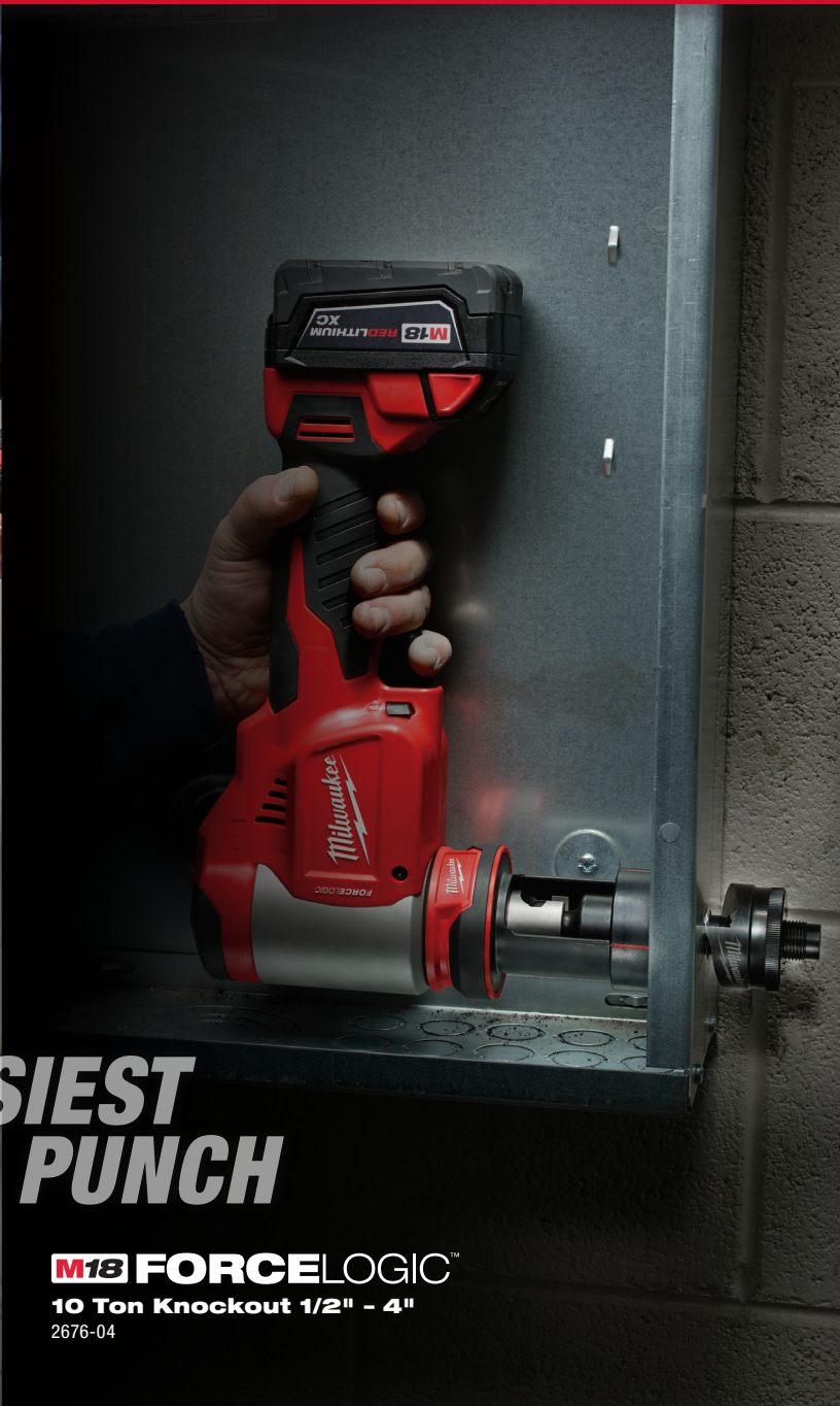
M18 FORCELOGIC™ 10 Ton Knockout 1/2" - 4" 2676-04