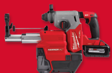
M18 FUEL 2912-22DE 1" SDS Plus Rotary Hammer & HAMMERVAC™ Dedicated Dust Extractor Kit