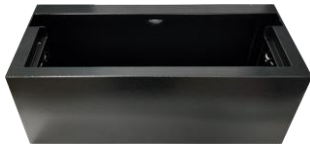
Fountain Base 1x