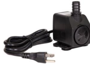
Fountain Pump 1x