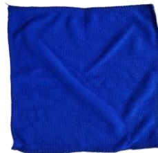
Cleaning Cloth 1x