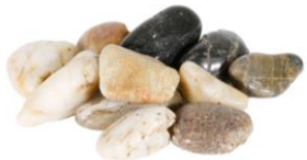
Bag of Rocks 1x