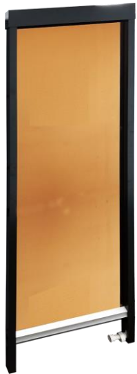
Fountain Top 1x