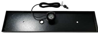
Fountain Tray with Light 1x