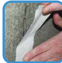
3. Press Firmly in Place