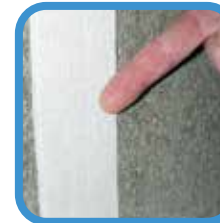
4. Ready to Coat