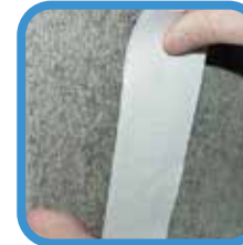
2. Line up with Seam