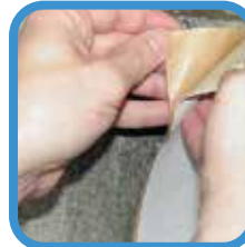
1. Peel off Backing

Surfaces with joints, cracks or where two unlike surfaces come together may require Ames® Peel & Stick™ Seam Tape (2"x50', 4"x50', and 6"x50') to provide additional strength and reinforcement. (See Peel & Stick™ Seam Tape label for instructions.)