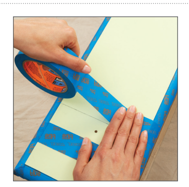
Mask your pattern with ScotchBlue™ Painter's Tape for Delicate Surfaces.