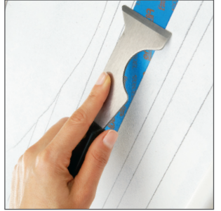
Seal Tapes Edges

Don't Stretch It When masking any surface, pull tape off the roll a few feet at a time. Avoid stretching the tape, as this can cause it to lift up or break.