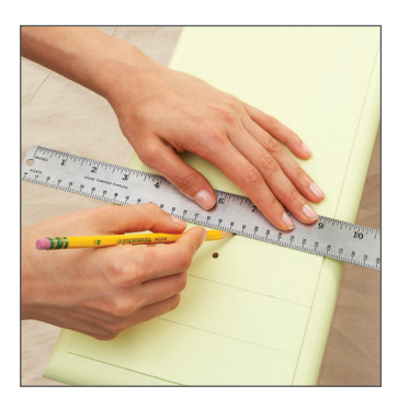
Using a ruler and a pencil, measure and draw your pattern.