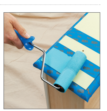
Paint your darker shade, and gently remove the tape before the paint dries.