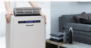
Easy to Maintain, Easy to Store