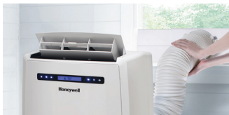
Quick and Easy Installation - Save Time, Save the Heavy Lifting