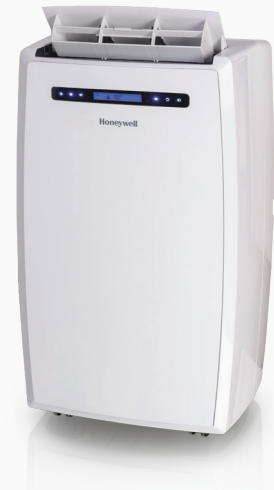
Product Dimensions (in): 18.1 (L) 15.2 (W) 29.3 (H) Net Weight: 79.4 lbs / 36 kg

Unlike a fixed AC, this unit requires no permanent installation and four caster wheels provide easy mobility between areas. Plus, the auto-evaporation system allows for hours of continuous operation with no water to drain or no bucket to empty. This model comes with everything needed including two flexible exhaust hoses and an easy-to-install window venting kit. The window vent can be removed when the unit is not in use.