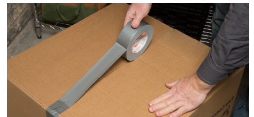
Securely sealing cardboard boxes

Use the guide on the back to select the right 3M™ Duct Tape for your project.