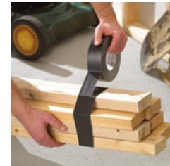
Bundling large loads