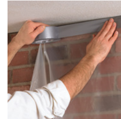
Hanging poly sheeting