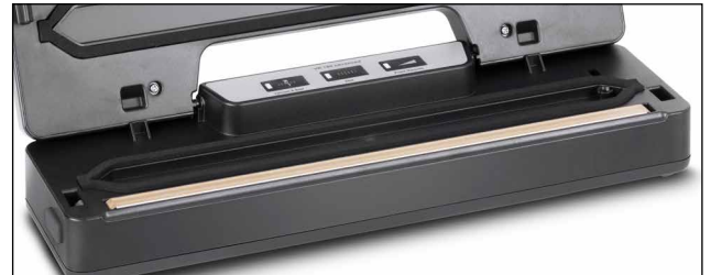
BIG SEALING BAR With a weld of up to 12 inch in length