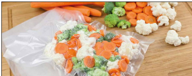
INCLUDED A vacuum hose for containers, 10 professional bags 8" x 11" & a portable cutter