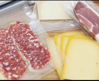
Keeps foods fresh up to 8 x longer