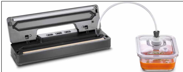
INCL. VACUUM CANISTER FUNCTION