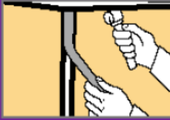
Wall Joints Joints Muraux Juntas de la Pared