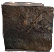
Fountain Back Door 1x