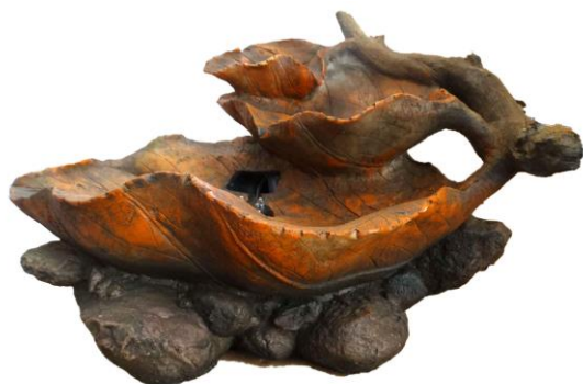
Fountain (Pump & LED lights pre-installed) 1x