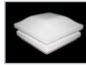
Curved - Smooth