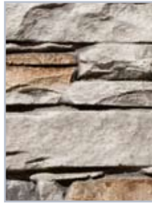
Stacked Stone - Gray