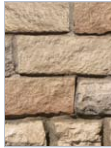
Stacked Stone - Beige