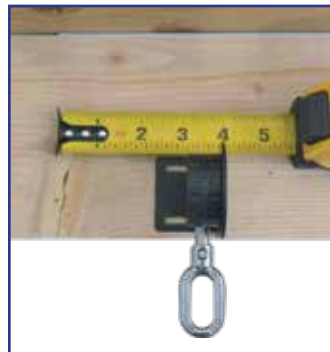
(Pole, PVC Fabric) Wall/Ceiling: 1.5" Width