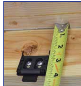
(Pole/Motor with Valance) Wall: Above, 1"