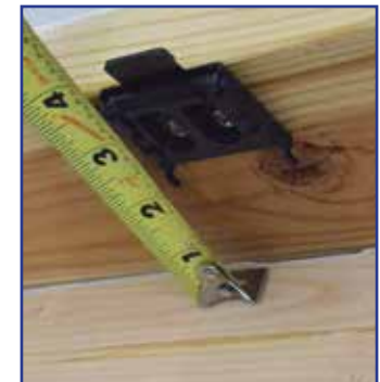
(Pole/Motor with Valance) Ceiling: Behind, 1"