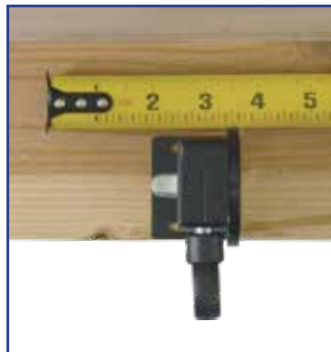
(Pole, PE Fabric) Wall/Ceiling: 1.5" Width