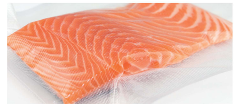
Fish and poultry