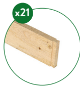
4ft. x 3.5 in. Boards