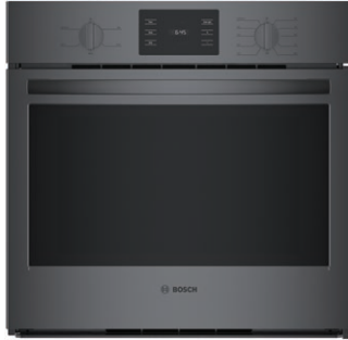
HBL5344UC Black Stainless Steel