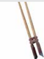
Post Hole Digger or Auger