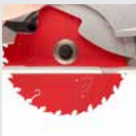
Circular Saw or Handsaw