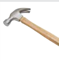
Hammer, Nail Gun, Cordless Drill