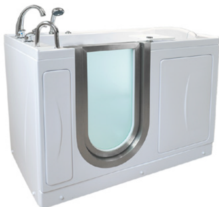
MH03167-HB Left Hand Door & Drain