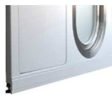
Baseboard On (not supplied)