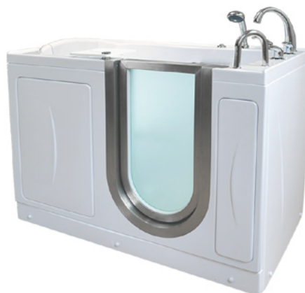
MH03168-HB Right Hand Door & Drain