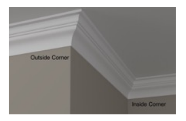
For 90° Inside and Outside Corners -Bevel at 30° -Miter at 35.26°