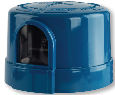
5237-UL Electronic LED Photocontrol Mounting Turn-Lock