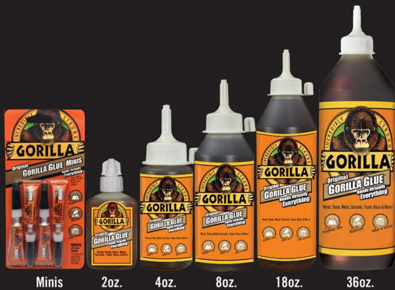
Minis 2oz. 4oz. 8oz. 18oz. 36oz.