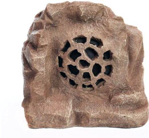
Solar Bluetooth Speaker -1