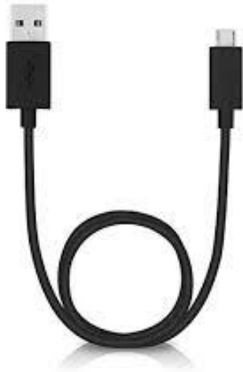
36" USB Charging Cable -1