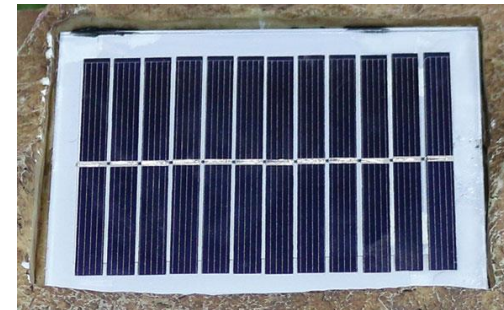
Solar Charging Panel

*Charge times may vary depending on solar conditions.